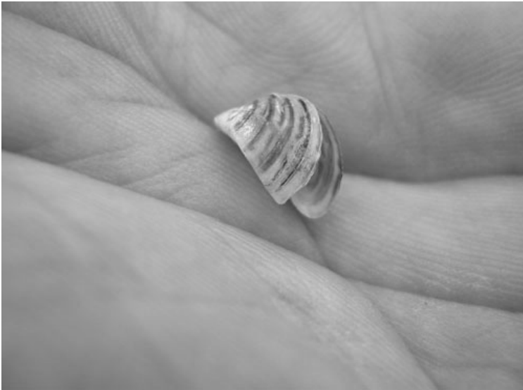
Mussel Shell on palm of human hand