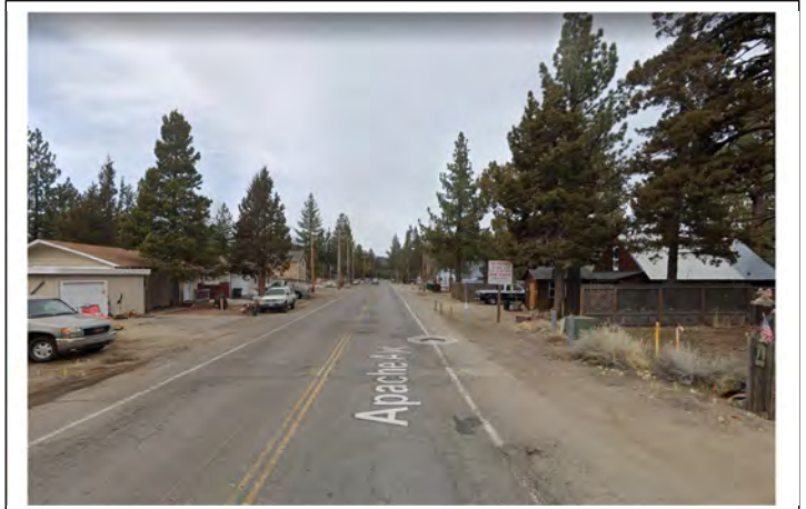
View north on Apache, due north of Hwy 50