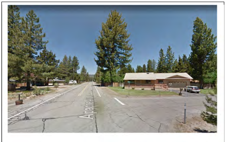
View north on Apache at Pueblo Intersection