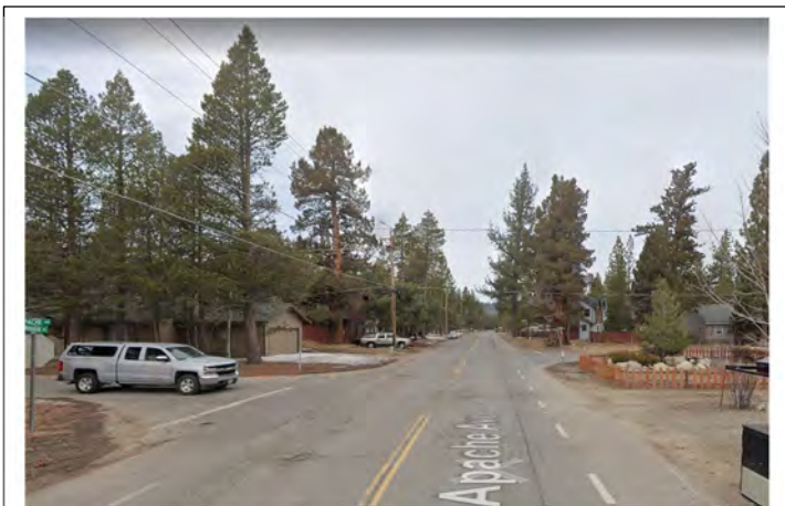
View north on Apache at Arrowhead Intersection