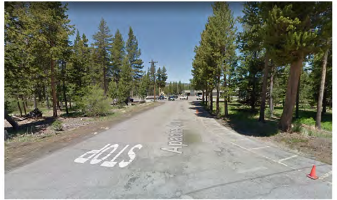
View north on Apache at Magnet School entrance. Due north of San Bernardino Intersection.