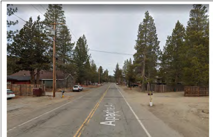
View north on Apache