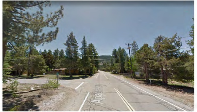
View south on Apache at Tomahawk Intersection