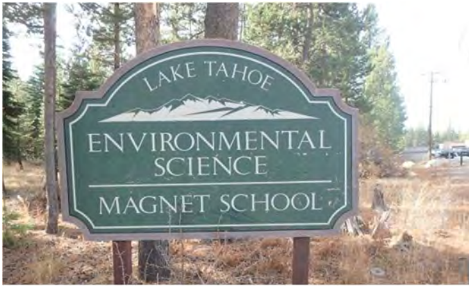
Magnet School Sign