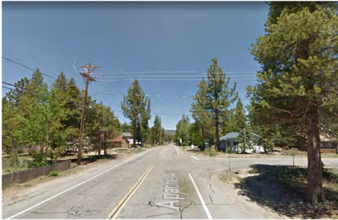
View north on Apache at Tomahawk Intersection