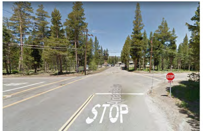
View north on Apache at San Bernardino Intx