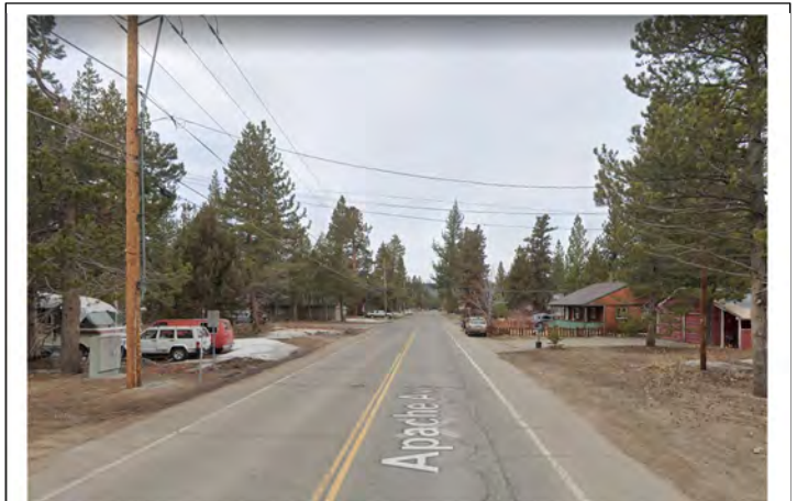
View north on Apache