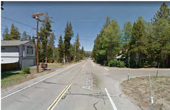
View north on Apache at Sioux Intersection