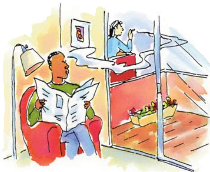
Illustrations by Janet Cleland © California Department of Public Health

As a general rule, it is unwise to file a lawsuit unless you have suffered significant harm. Your chance of convincing a court that you have a justifiable legal claim is far better if you can show that you have been harmed badly by repeated, unwanted exposure to secondhand smoke in your apartment—for instance, if you have visited a doctor with frequent respiratory complaints, missed work due to illness caused by the smoke, stayed away from